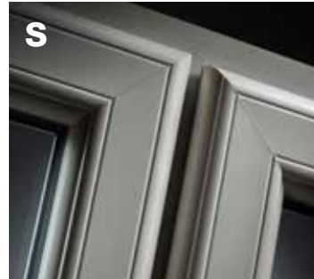
S SCULPTURED Sash Frame

You can also choose to have a different colour for the inside and outside parts of your window frames. This means you can match your property's interior and exterior respectively.