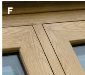
F FLUSH Sash Frame